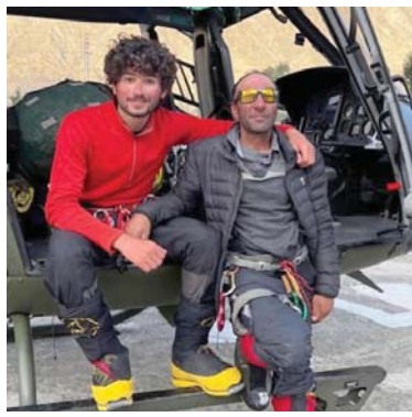
est mountain in the world.