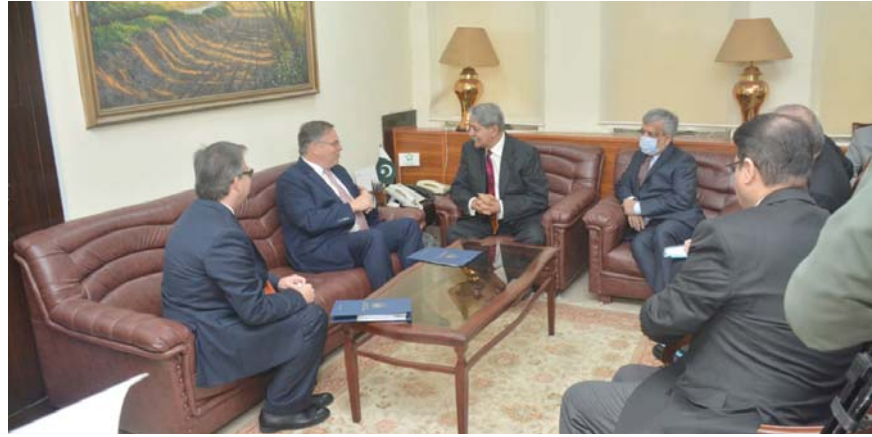
ISLAMABAD: U.S. Ambassador to Pakistan Donald Blome called on the Minister for Commerce Syed Naveed Qamar at the Ministry of Commerce here on Wednesday.

The ambassador appreciated the significant growth seen in exports from Pakistan to the U.S. and expressed the hope for a deeper and wider bilateral relationship in the fields of trade and investment, digital services, science