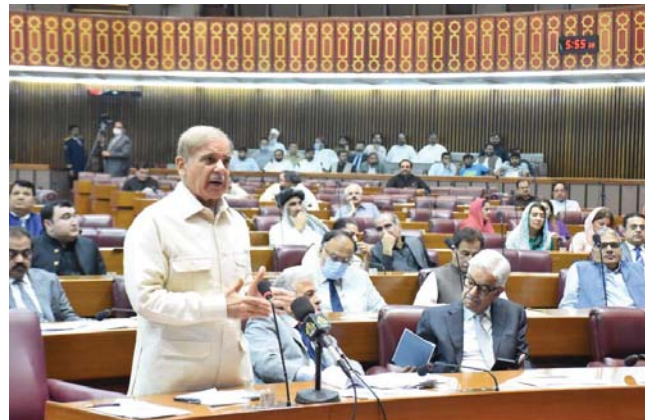
Prime Minister Shehbaz Sharif addressing National Assembly session in Islamabad on Wednesday.

Expressing his gratitude to the Chinese leadership for extending support to Pakistan in every difficult hour, Shehbaz Sharif said the Chinese cooperation and investment has helped improve infrastructure and public transport system besides addressing the electricity crisis to a great extent.