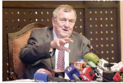
ISLAMABAD: Mark Bristow, President and Chief Executive Barrick briefing Pakistani media on the company's plans for the development of Reko Diq Copper-Gold project, here on Monday.