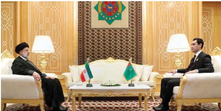
ments of cooperation inked by the two states during Berdimuhamedow's visit to Tehran will accelerate the expansion of mutual cooperation.

Stating that Iran-Turkmenistan relations are rapidly expanding based on the development of neighborly ties and mutual trust, as well as broad cooperation, the President added that the implementation of the memoranda of understanding (MoUs) and docu-