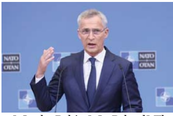
va? Or the Baltics? Or Poland? The answer is: all of them," he said. "We are deterring Russia to prevent it from destroying us and from destroying you."

MADRID: NATO declared Russia the "most significant and direct threat" to its members' peace and security on Wednesday and vowed to strengthen support for Ukraine, even as that country's leader chided the alliance for not doing more to help it defeat Moscow.