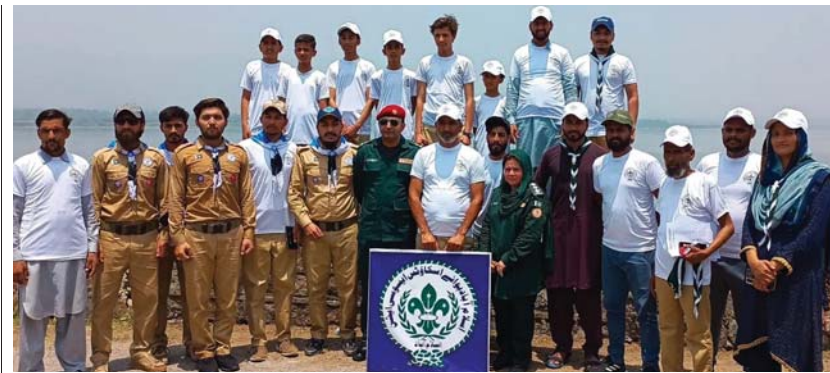
ISLAMABAD: Islamabad Boys Scouts Association (IBSA) participated in flood mock exercise organize by Punjab Rescue-1122 at Rawal Lake here on Wednesday.

"With a larger population, land use increases, which in itself can drive up temperatures further. Each heat wave will result in increased mortality and decreased productivity, since few people can work in 45-degree heat. I fear that if nothing is done, it can ultimately lead to a huge wave of migrations." (Courtesy: Science Daily)