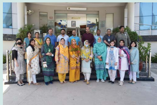
ISLAMABAD: A health care professional team from Islamic International Dental Hospital on study tour visited The Diabetes Centre here on Saturday.