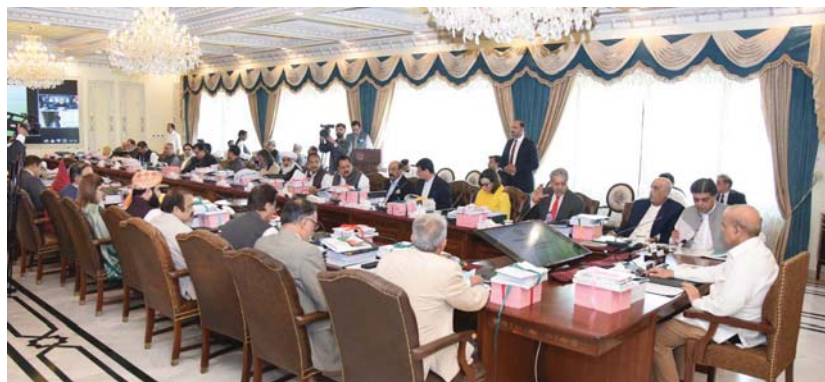
Prime Minister Shehbaz Sharif chairs Special Cabinet Meeting in Islamabad on Friday.

Govt employees' salaries increased to 15%