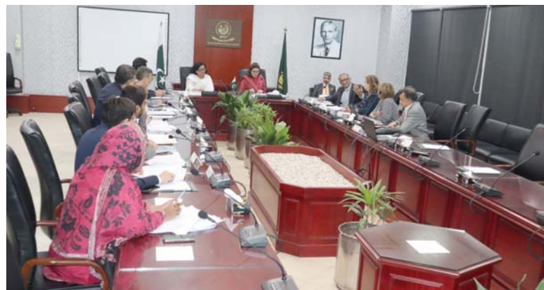
ISLAMABAD: Federal Minister for Poverty Alleviation and Social Safety Division Shazia Marri chairs meeting with World Bank's Implementation Support Mission for CRISP and NSSP at BISP Headquarters.

Ms. Shazia Marri welcomed the WB's mission. She appreciated the role of World Bank, as a major development partner, in providing continuous and valuable